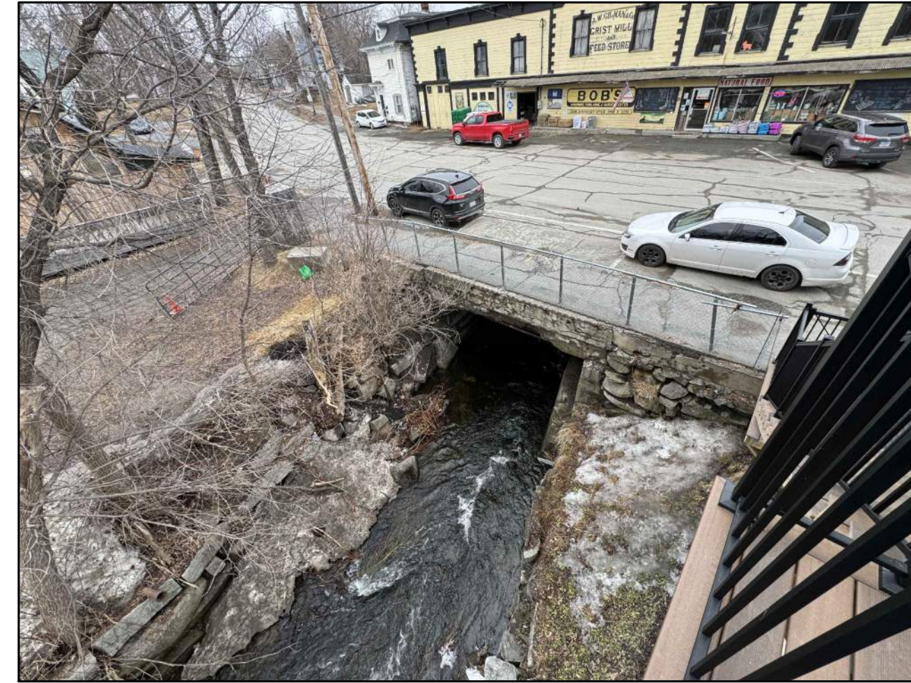
PHOTO 1 UPSTREAM ELEVATION