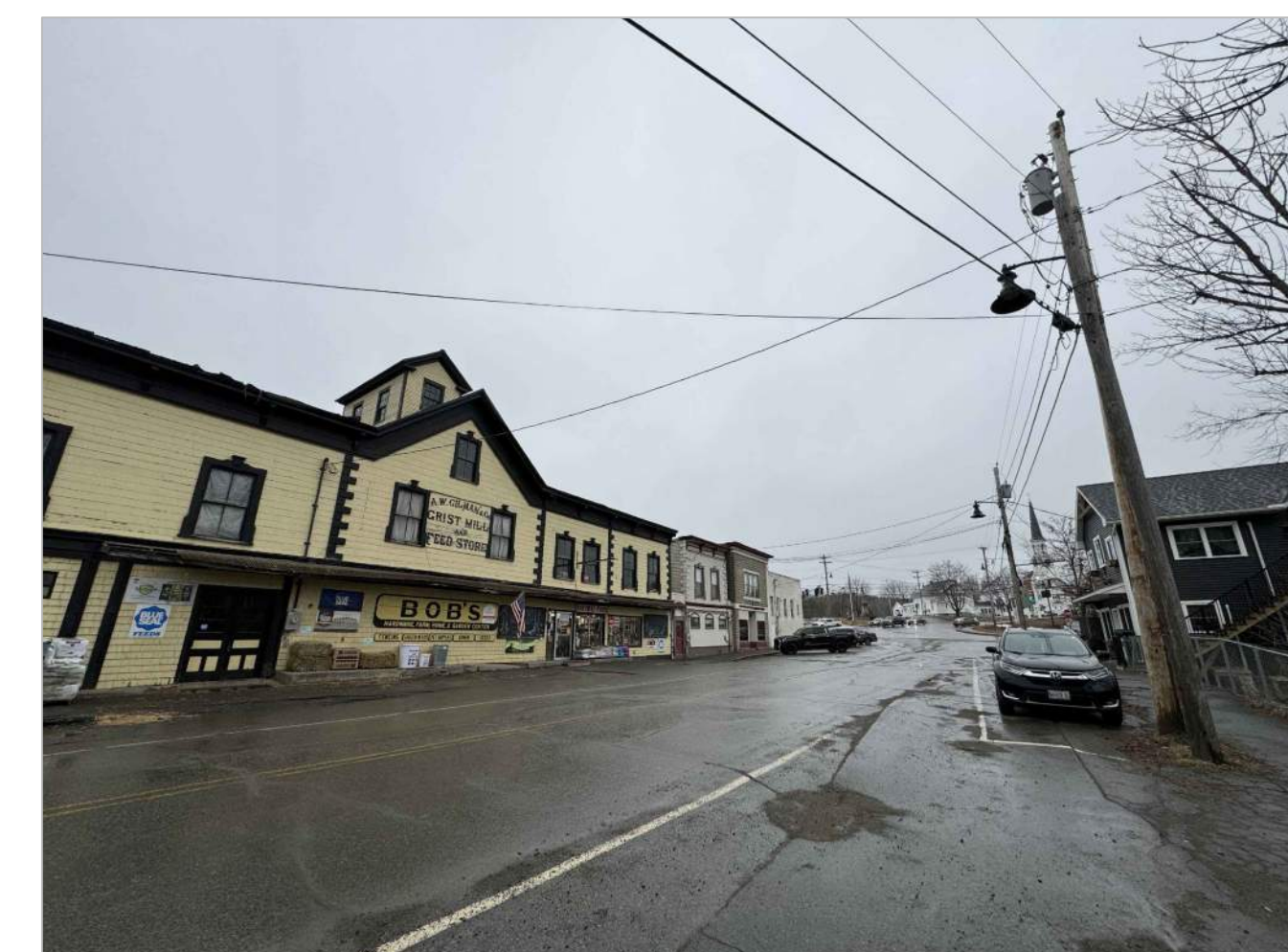
PHOTO 6 LINCOLN STREET EAST APPROACH

STATE OF MAINE TOWN OF DOVER-FOXCROFT PREPARED BY: WRIGHT-PIERCE PROJECT NO. 21764 BRIDGE NO. 0970 BRIDGE PLANS