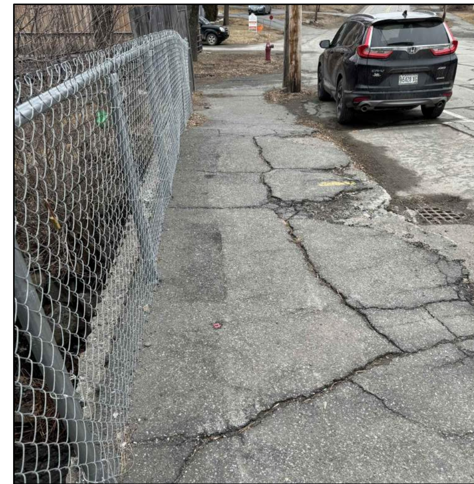
PHOTO 3 SIDEWALK