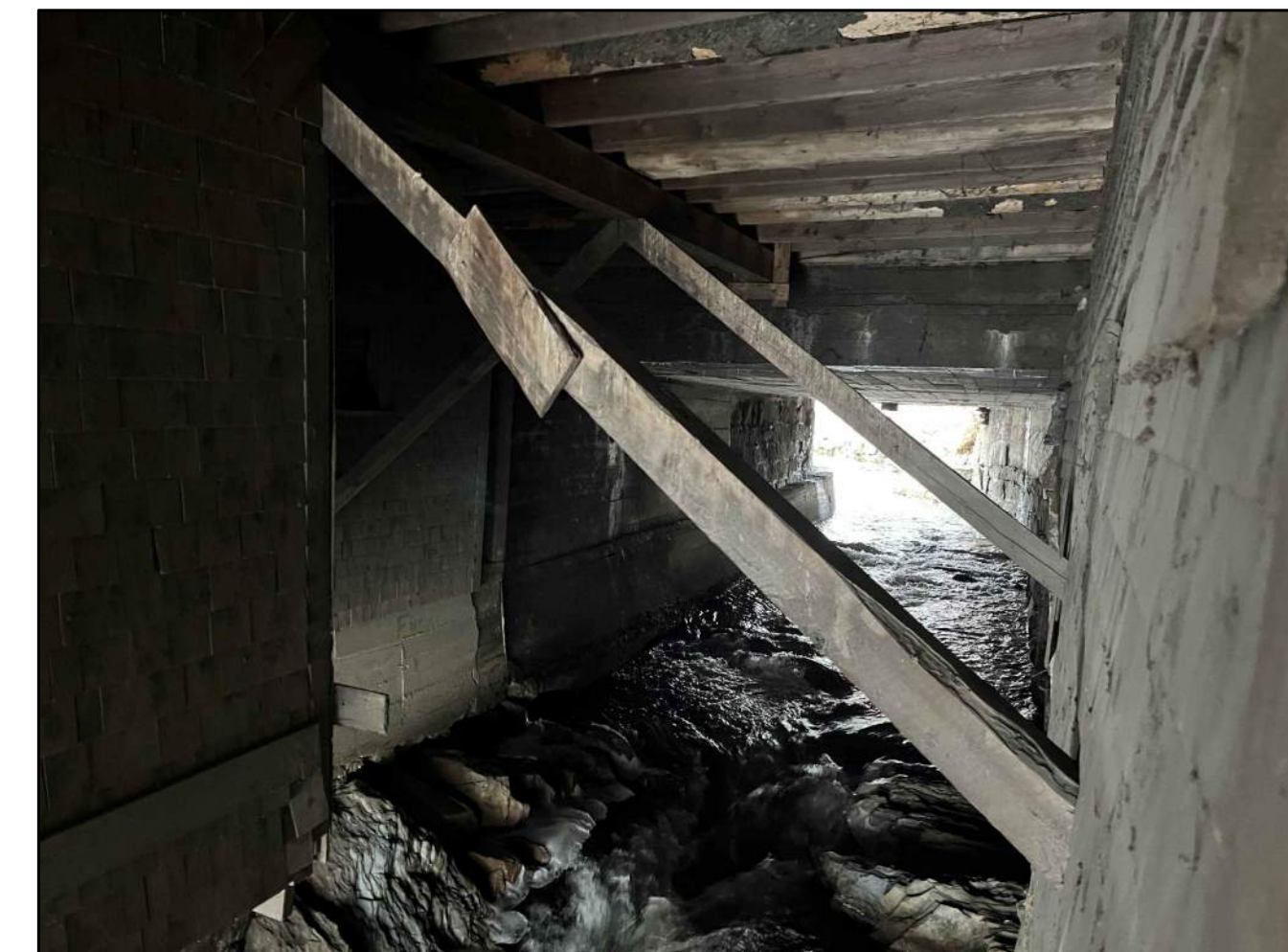
PHOTO 4 DOWNSTREAM LOOKING UPSTREAM