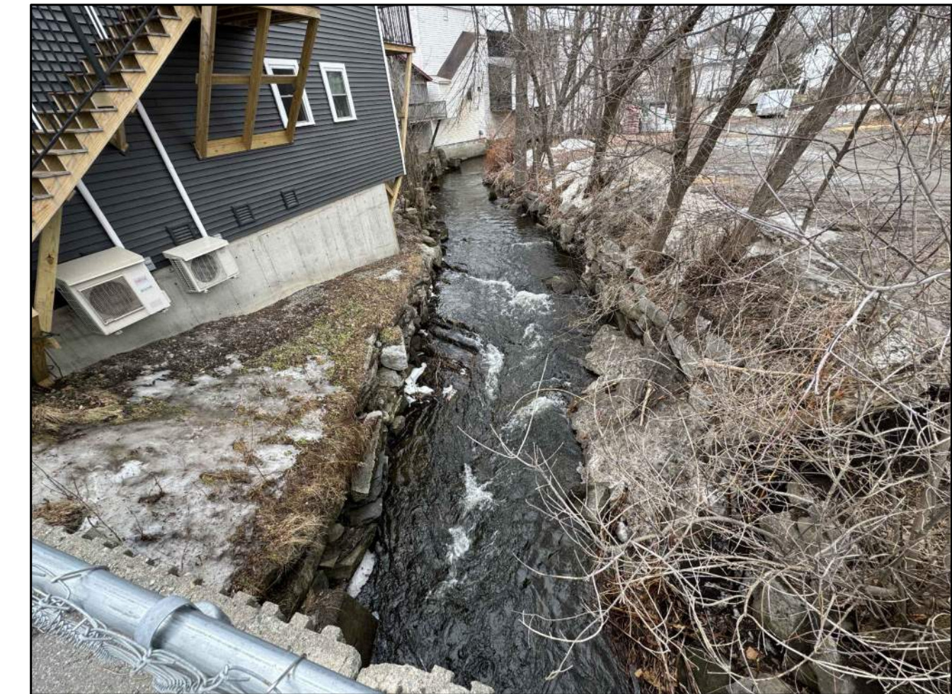
PHOTO 2 UPSTREAM